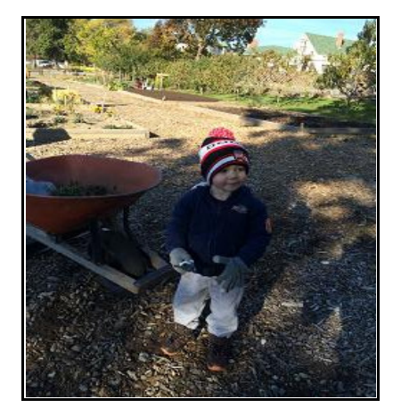
Anyone recognize this very cute small Towne Centre gardener?