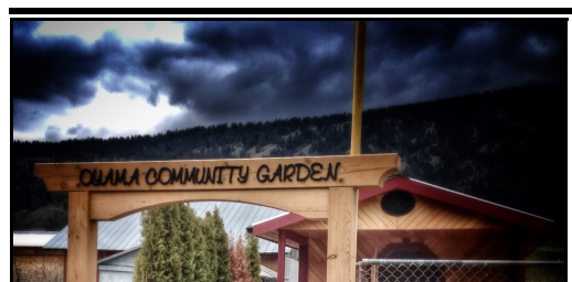
OYAMA COMMUNITY GARDEN Oyama Community Club 15710 Oyama Rd

The Oyama garden had a great year. All plots were rented with one plot grown for the Lake Country food bank.